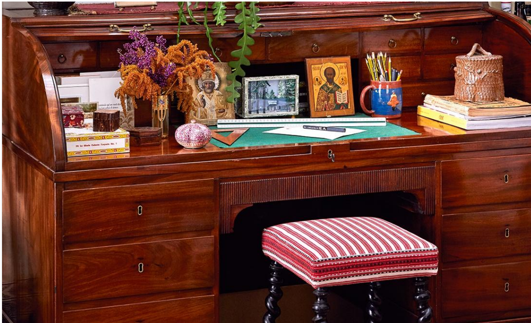
A Persian Qajar painted panel above a 19th-century Danish desk MIGUEL FLORES-VIANNA