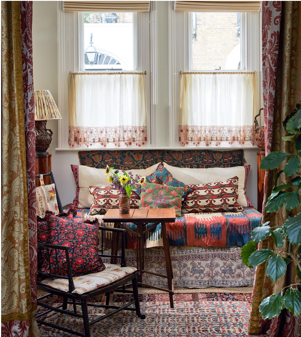
Vintage textiles on a day bed MIGUEL FLORES-VIANNA