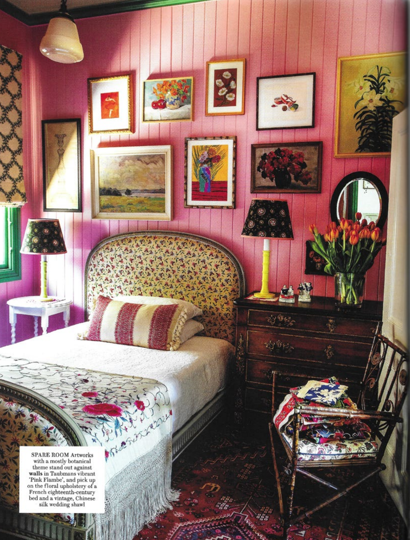
SPARE ROOM Artworks with a mostly botanical theme stand out against walls in Taubmans vibrant 'Pink Flambe', and pick up on the floral upholstery of a French eighteenth-century bed and a vintage, Chinese silk wedding shawl