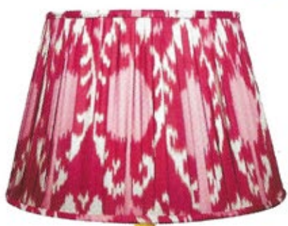
Lacquered beech 'Tall Mimosa Yellow Glossy Lamp', 45 x 15cm, £145, from Rosi de Ruig; with 'The Red Pomegranate Silk Ikat Lampshade', by Melodi Horne, 30 x 45cm, £395, from Pentreath & Hall

I like a jumble of styles and a mix of colour and patterns - nothing matches in my world