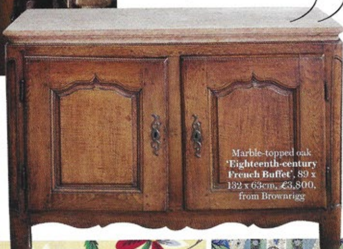
Marble-topped oak 'Eighteenth-century French Buffet', 89 x 132 x 63cm, £3,800, from Brownrigg