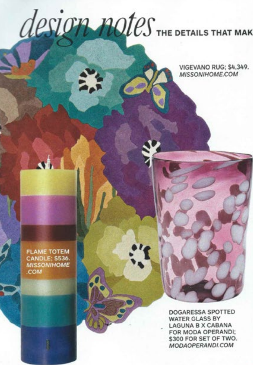
VIGEVANO RUG; $4,349. MISSONIHOME.COM