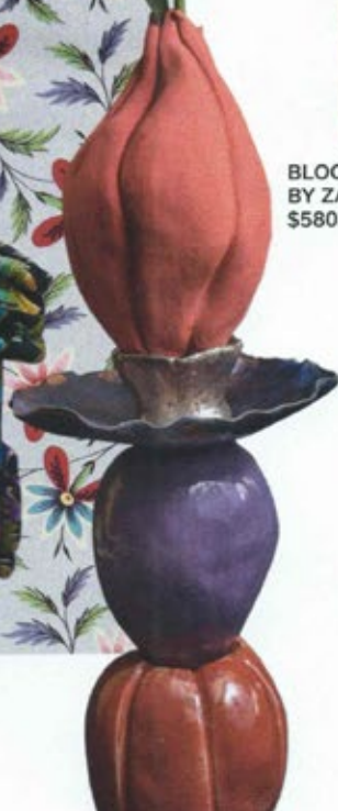
BLOOMEN #6 VASE BY ZANELLAZINE; $580. ARTEMEST.COM