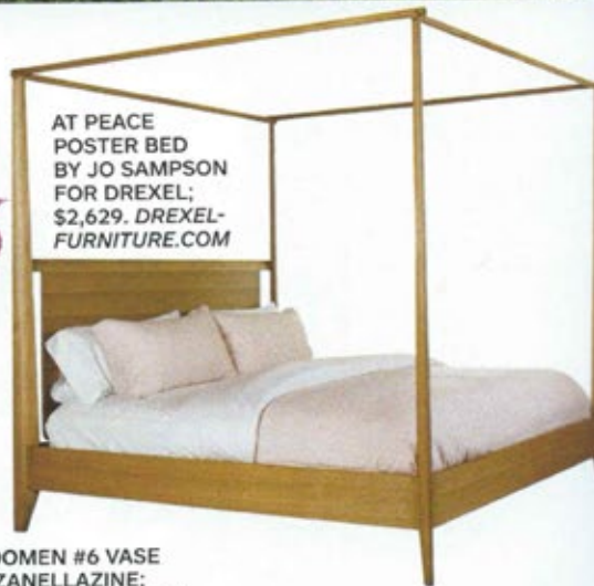
AT PEACE POSTER BED BY JO SAMPSON FOR DREXEL; $2,629. DREXEL- FURNITURE.COM