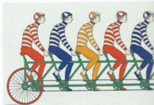
MULTILETTE WALLPAPER BY FORNASETTI FOR COLE & SON; TO THE TRADE. LEEJOFA.COM