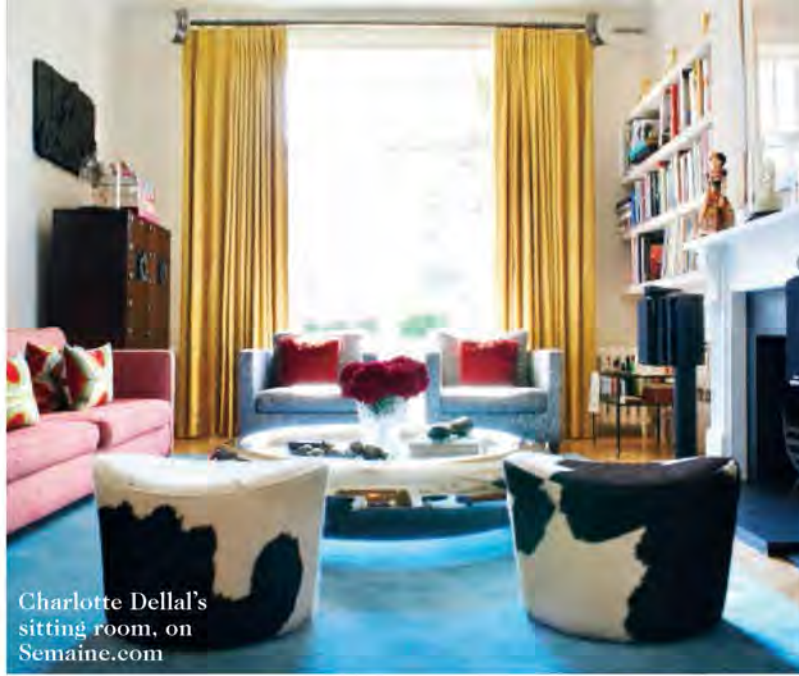
Charlotte Dellal's sitting room

Semaine is a new lifestyle website, still very much in its infancy, which offers visitors a weekly window into the lives of the chic and famous. Whether it's your